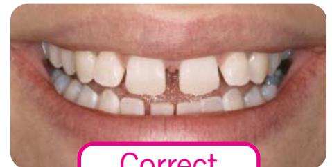
Correct spaces between teeth