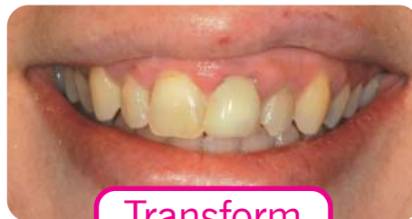
Transform discolored & crowded teeth