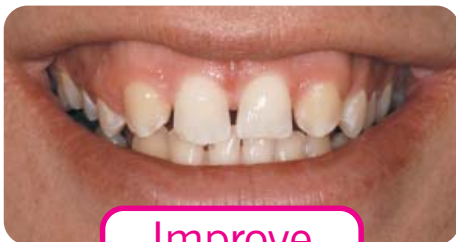
Improve teeth size & gumline